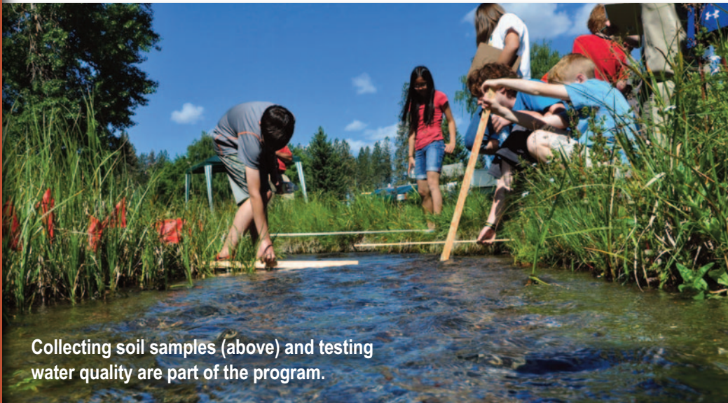
Collecting soil samples (above) and testing water quality are part of the program.