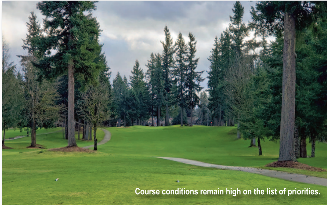
Course conditions remain high on the list of priorities.